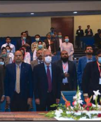
Faculty and Audience standing during National Anthem