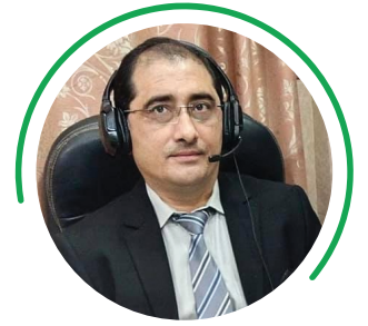
Abdul Qadir Khan